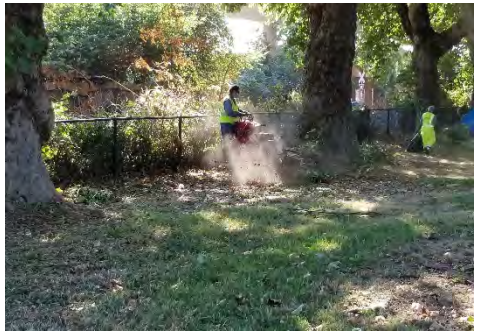
Removing debris and litter